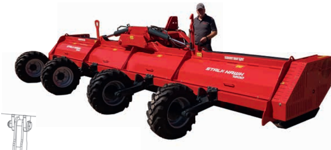
Photo: STALK HAWK 7224F with European pneumatic tires